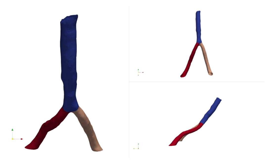
Figure 2. 3D reconstructed model of the vertebrobasilar system. After locking all models in the same position, the Vascular Modeling Tool Kit (VMTK) application using Python scripts identifies and measures the left (tan) and right vertebral artery (red) and the basilar artery (blue).

We set a difference of 0.3 mm or higher in diameter to define the dominance between the two VAs. Volume, curvature, torsion, and tortuosity was also measured on both VAs. The angle of the vertebrobasilar junction was measured between the two VAs. On the BA, we measured the length, volume, curvature, and cross-section. We further grouped patients based on a two-step process. First, we connected the confluence of the VAs and the basilar top with a straight line. Second, we separated each patient based on if the BA deviated to the left or to the right, while also measuring the extent of the deviation.